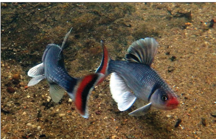
Fieryblack Shiners ( Cyprinella pyrrhomelas ), (Catawaba drainage).

happened and while she immediately gave a yelp and fell, she did not drop the bucket. Kudos to her!