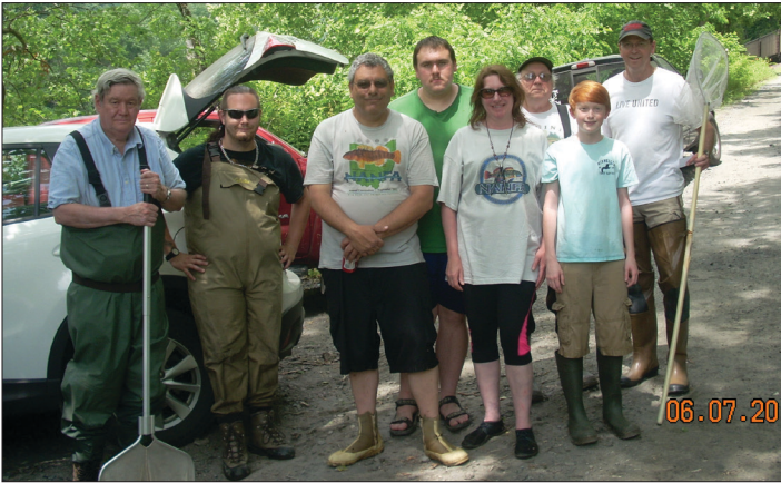
Team Nolichucky.

group visited Cranberry Creek, which had possessed many beautiful and highly colored shiners when sampled at the 2007 Convention. Alas, not so in 2014. They kept working upstream in hopes of finding something interesting, to no