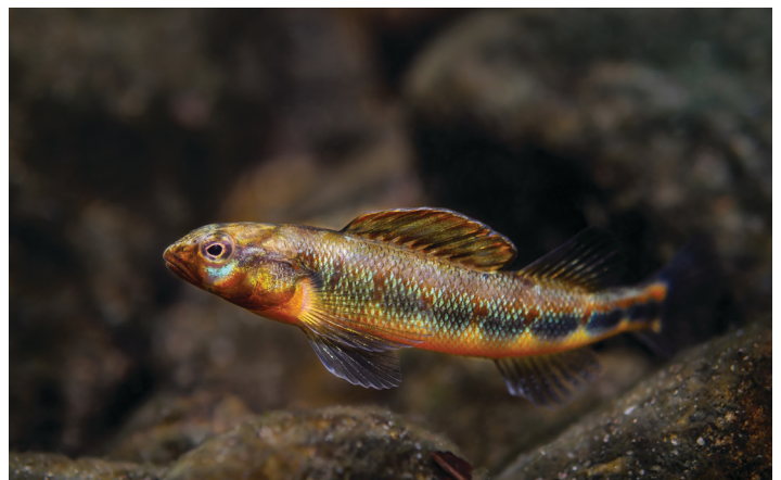
Snorkeling photos during the convention (clockwise from top left). Cane River: Striped Shiner, River Chub building a nest, Whitetail Shiners. South Toe River: Blotchside Logperch, Gilt Darter, Greenfin Darter. Wilson Creek: Bluehead Chubs. Three Top Creek: Appalachia Darter.