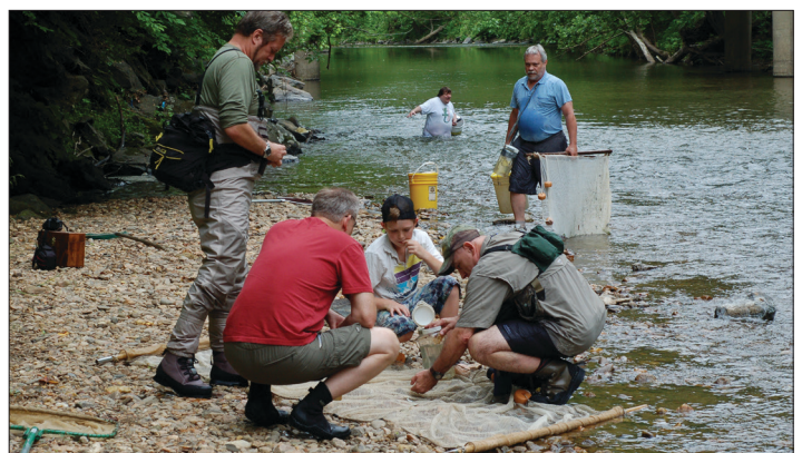
The crew seining the Ivy River and checking out the catch.