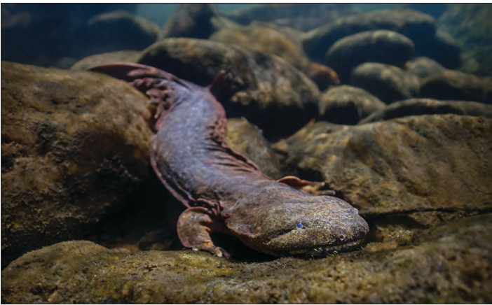
Eastern Hellbender ( Cryptobranchus a. alleganiensis ), South Toe River.