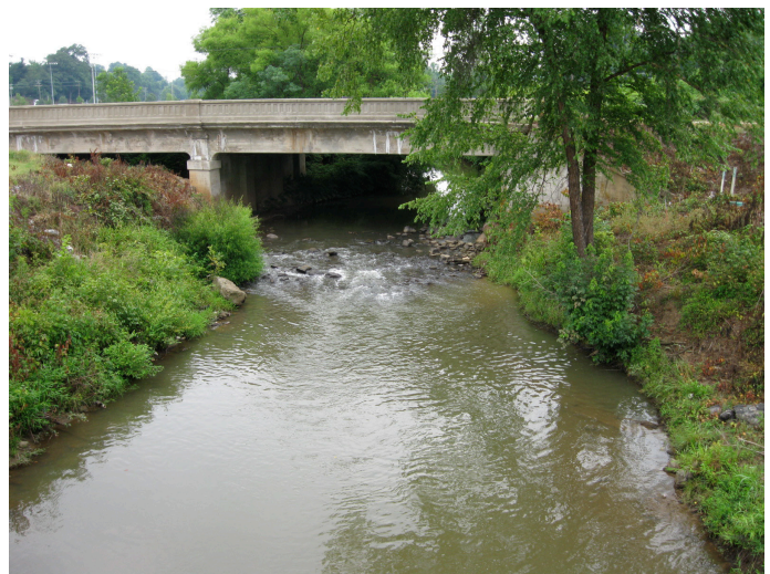
Figure 3. Salem Creek, looking upstream from the South Main Street bridge, City of Winston-Salem, Forsyth County. Bluehead Chub were collected in the riffle in July 2009.

On that day in July 2009, fish indigenous to and common in tributaries of the middle Yadkin River system such as the catostomids Brassy Jumprock, Moxostoma sp., and Notchlip Redhorse, Moxostoma collapsum , were absent as were Tessellated Darter, Etheostoma olmstedi , and Carolina Fantail Darter, Etheostoma brevispinum . Nonindigenous fish species syntopic with the Bluehead Chub at this site were the tolerant Red Shiner, Cyprinella lutrensis , the nest associate Rosefin Shiner, Lythrurus ardens , and the piscivorous Flathead Catfish, Pylodictis olivaris (including one specimen about 850 mm total length). Only two indigenous species were collected along with Bluehead Chub—the tolerant Redbreast Sunfish, Lepomis auritus , and Largemouth Bass, Micropterus salmoides .