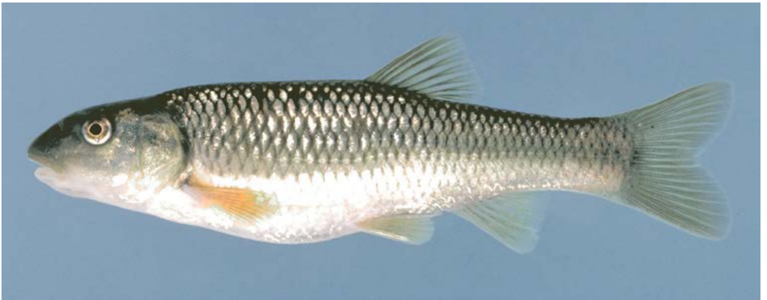
Images by N. Burkhead and R. Jenkins, courtesy of Virginia Department of Game and Inland Fisheries. Male Bluehead Chub above, female below.