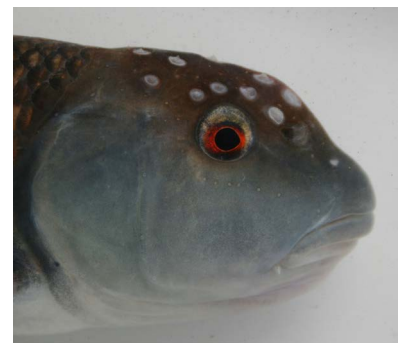
Male Bluehead Chub with close-up of head and tubercles Mayo River, North Carolina.