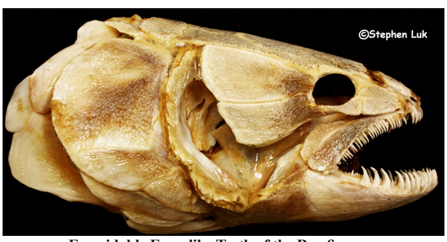
Formidable Fang-like Teeth of the Bowfin

One more remarkable adaptation completes the unique mudfish package – accounting for the name "Bowfin." Maneuvering in close quarters and in heavy vegetation can be a problem, especially for a large fish. But nature has provided the mudfish with an elegant solution. By undulating its long dor-