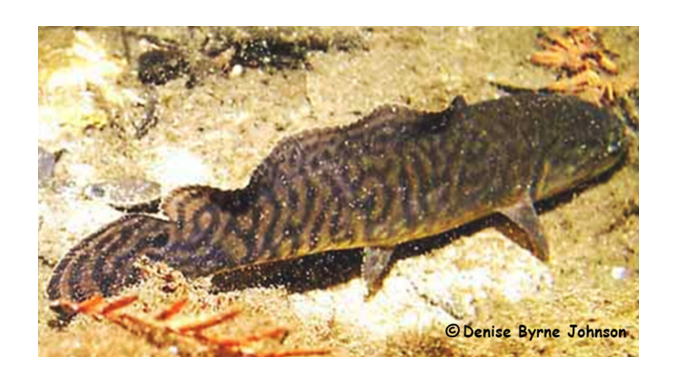
The long undulating dorsal fin of the Bowfin

length of about one foot in their first year. They live 10-15 years maximum, but few will survive beyond age five. Sexual maturity comes at age 2-3.