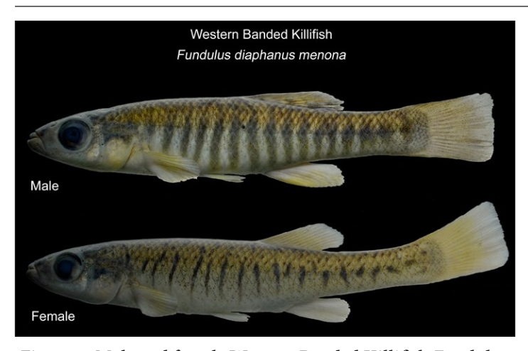
Figure 2. Male and female Western Banded Killifish Fundulus diaphanus menona .

Based on lateral row scale counts, all Banded Killifish collected in Illinois prior to the year 2000 were Westerns (Fig. 2). This is what everyone previously thought. In parts of Lake Michigan, the Chicago Area Waterways System, and Illinois River that were colonized after 2000, the individuals had lateral row scale counts completely intermediate between Westerns and Easterns. This is a classic hybrid pattern that ichthyologists have been familiar with for decades (e.g., Hubbs 1955). Meanwhile, in the Mississippi, the majority of individuals were identified as Westerns, although one was identified as a hybrid. So, what we observed were hybrids of Western Banded Killifish and Eastern Banded Killifish (Fig. 3) that somehow invaded several new watersheds and expanded their range westward by several hundred miles!