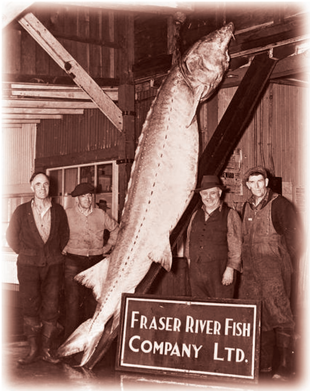
Adult White Sturgeon, Acipenser transmontanus .