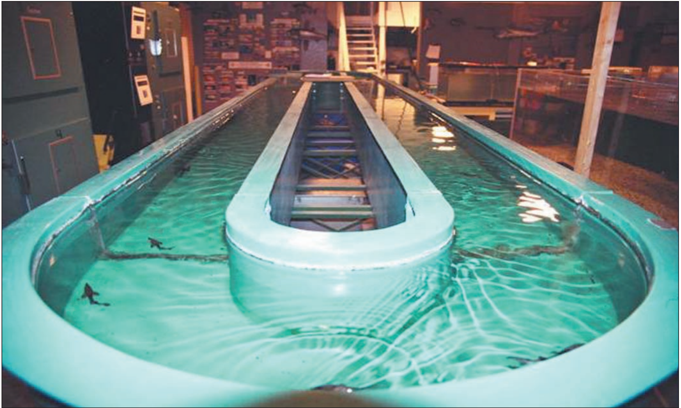
Fig. 3. Racetrack used to train juvenile White Sturgeon.

our variable accommodations. Colors ranged from black, gray, white with gold highlights, and pure white (Table 2). White Sturgeon from tanks with lighter bottoms were more likely to exhibit darker pigmentation than those from tanks with darker bottoms. When ventral surfaces were dark, however, lips and the oral cavity were still lightly pigmented (Fig. 4). Frequency of the different pigmentation patterns were not correlated with size of fish but may have been influenced by size of the tank, with darker fish being more common in smaller tanks. Relative roles of bottom color and tank size on fish pigmentation cannot be determined, however, without