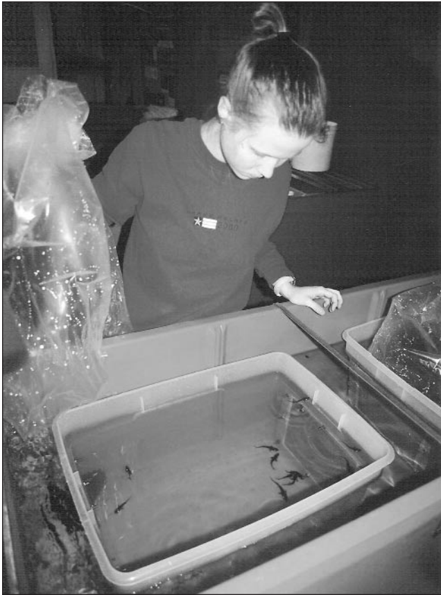
Fig. 2. Juvenile White Sturgeon in plastic mesh-sided tubs submerged in a Living Streams recirculating tank.

They rarely dash about the tank and we have observed no injuries, including fish maintained in the traditional all-glass aquarium with sharp corners. Our fish also seem to lack the “jumping” behavior seen by other captive sturgeon species. Therefore, the water levels in the tanks can be relatively high and a cover is not necessary. A previous account of a captive White Sturgeon (76 mm TL), indicated more extreme behavior (caught in plants and cutting rostrum on tank) in captivity and required special modification of its tank to prevent the fish from injuring itself (Fulton, 1985).