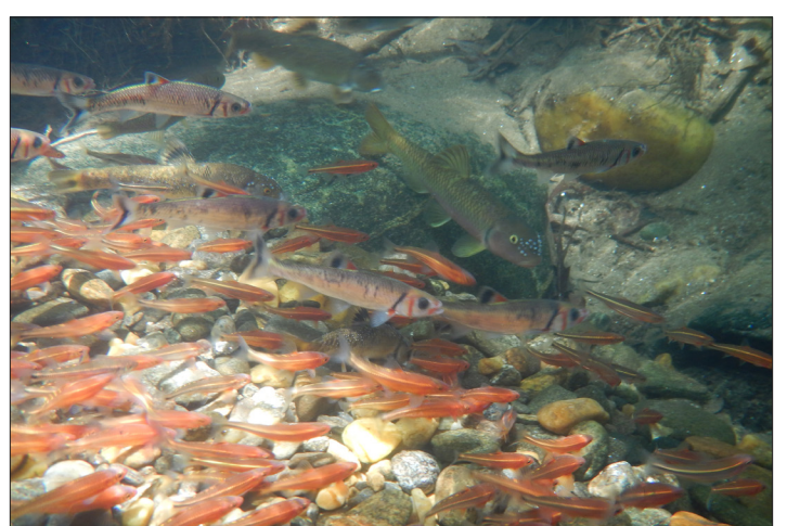
Figure 18. River Chub mound being used by Warpaint Shiners, Tennessee Shiners, and Central Stonerollers in the South Toe River, French Broad River Basin.

Without the mounds built by these engineers, many of our aquatic species would have lower reproductive success or not