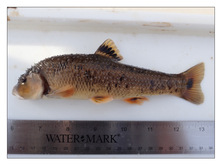
Figure 2. Male Central Stoneroller with breeding tubercles.