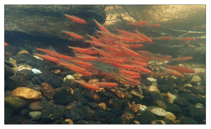
Figure 19. River Chub mound being used by Saffron Shiners N. rubricroceus and Tennessee Shiners N. leuciodus in the Little River, French Broad River Basin.