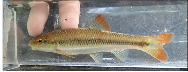
Figure 9. Young Bluehead Chub from the Toxaway River, Savannah River Basin.

Bluehead Chub (Figures 9–12) is native to Atlantic slope river basins. This includes the Savannah, Catawba, Broad, and Yadkin/Pee Dee river basins. Bluehead Chub often have tan or yellow fins, except for some in the Savannah River watershed that show red fins (Figure 9) outside of spawning season. Spawning males grow large tubercles above the nostrils (Figures 10–11) and often have a bright blue head, and this position of the tubercles in a breeding male is the easiest way to differentiate these three species (Figures 13–14, at end of article).