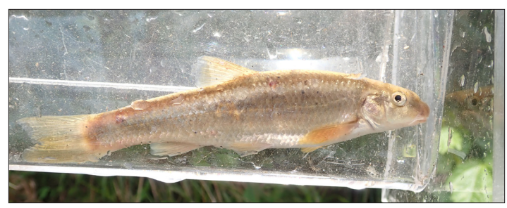
Figure 5. Female Central Stoneroller.