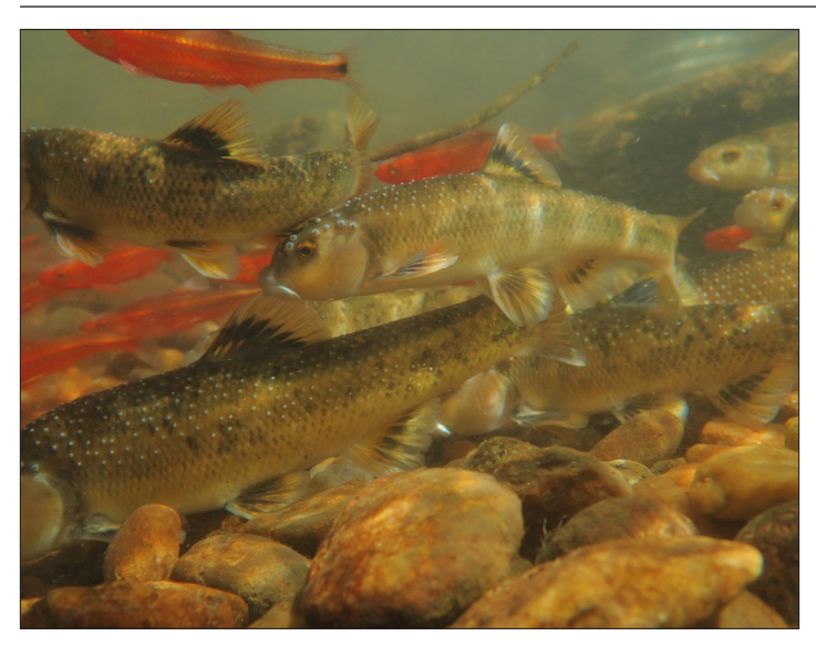
Figure 1. Central Stoneroller males schooling with Tennessee Shiners Notropis leuciodus in Cartoogechaye Creek, Little Tennessee River Basin.