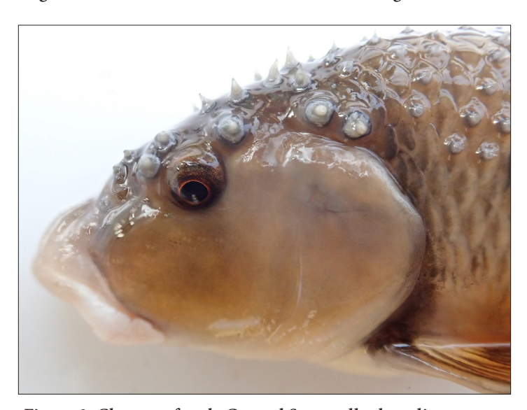
Figure 3. Closeup of male Central Stoneroller breeding tubercles present on its head.