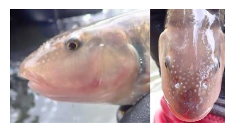
Figure 14c. Breeding tubercles of male Bigmouth Chub.