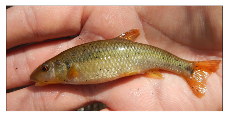
Figure 15. Young River Chub from the Little Tennessee River Basin.

River Chub (Figures 15–16) is found in streams that flow into the Tennessee River from WNC; this includes any stream in the Hi-wassee, Little Tennessee, French Broad, and Watauga river basins. River Chub is easiest to identify when it is a spawning male like Bigmouth and Bluehead Chubs. It can reach up to 13 inches and can be found anywhere from medium-sized streams to larger rivers. A breeding male grows large tubercles below the eyes on the snout. Its head also becomes very swollen and turns pink, purple, or red (Figure 16) when it is ready to spawn.