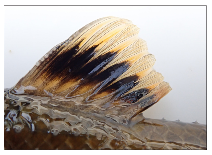
Figure 4. Closeup of male Central Stoneroller dorsal fin with breeding tubercles on first ray.