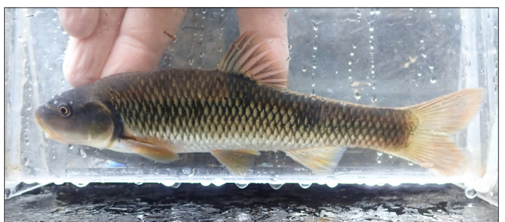
Figure 11. Male Bluehead Chub near spawning condition in the Savannah River Basin.