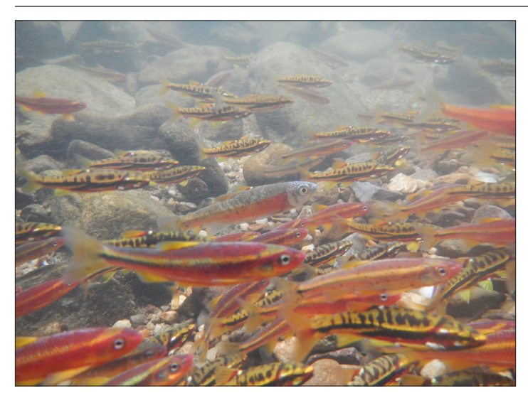
Figure 20. Mountain Redbelly Dace Chrosomus oreas, Saffron Shiners, Redlip Shiners N. chiliticus, and Rosyside Dace using a Bigmouth Chub mound in Helton Creek, New River Basin.

reproduce at all. Not only that, but due to their "engineering," they modify habitat, which is attributed to increasing species diversity and abundance of aquatic insects and fishes in the streams they occupy. Many additional species will use the nest (or "mound") for spawning and the associated school of fish for protection. Some fish species are so closely tied to chub mounds that they will not begin spawning until chub milt (sperm) is present in the mound.