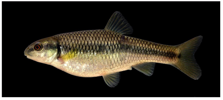
Figure 12. Female Bluehead Chub.