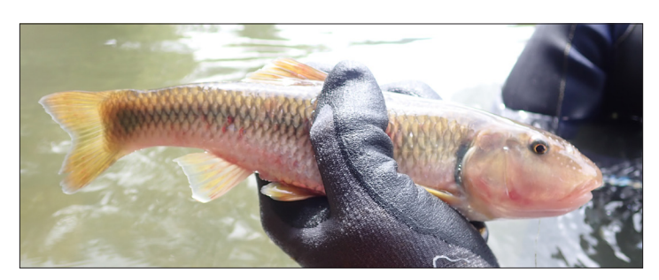
Figure 17. Male Bigmouth Chub from the New River in early spawning condition.

Bigmouth Chub (Figure 17) is similar to the other chub species, but it is only native to the New River basin of WNC and grows over 10 inches. As the name implies, this species has a larger mouth than its counterparts and it has a slightly more robust body shape. Unlike Bluehead Chub and River Chub, this species has many smaller tubercles above and below the nostrils. Similar to a River Chub, the Bigmouth Chub has a large pink to purple swollen head (Figure 17) when it is ready to spawn.