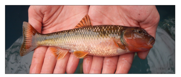
Figure 16. Male River Chub from the Big Laurel River, French Broad River Basin.