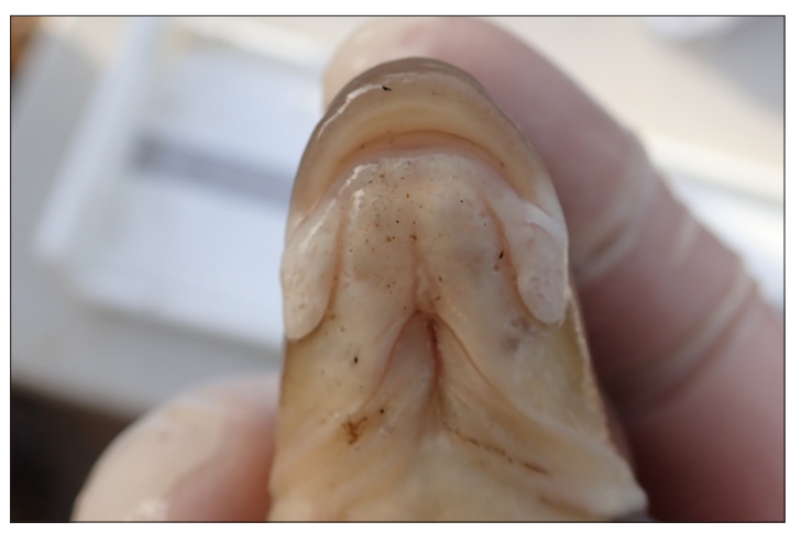
Figure 6. Closeup of Central Stoneroller mouth.