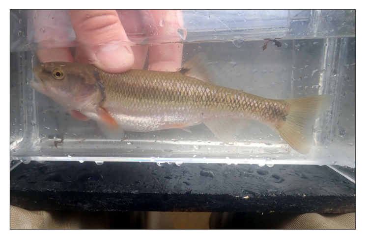
Figure 7. Male Creek Chub in early spawning condition.

The remaining four knottyheads are all chubs that can grow up to around 12 inches and are commonly caught while fishing for trout and other sport fishes.