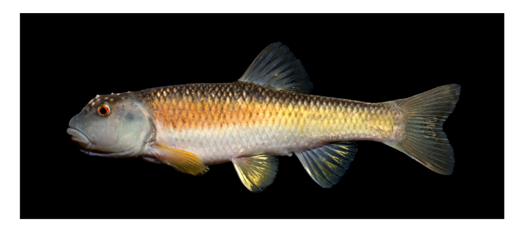
Figure 10. Male Bluehead Chub with spawning tubercles and colors.