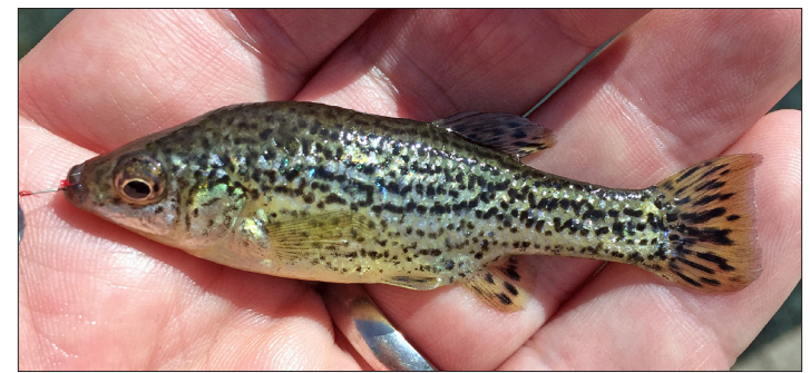
Figure 14. Left: Butterfly Splitfin. (male) Right: female.