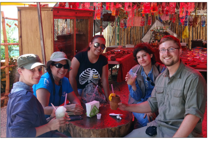
Figure 17. Left, top: a round mound of Guachimontones. Left, bottom: obsidian flakes. Above: post-tour libations at a nearby cantina.