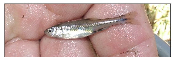
Figure 24: "Lake Cuitzeo" Jeweled Splitfin, Olive Skiffia (male above, and female), and Yellow Shiner.