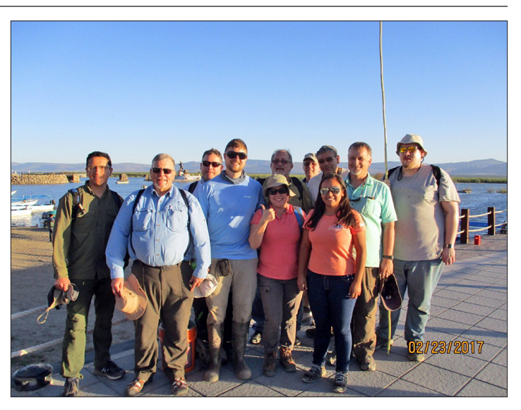
Figure 20. Left: Lago de Chapala's aerial performers. Right: 2017 Study Group.