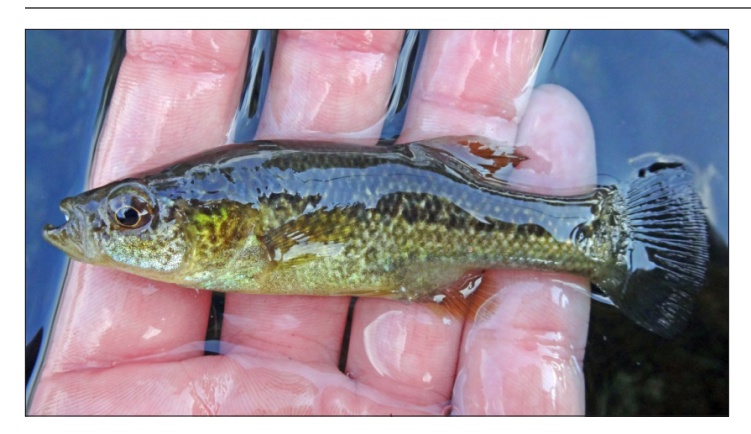
Figure 1. Bulldog Goodeid at Manantial La Luz.