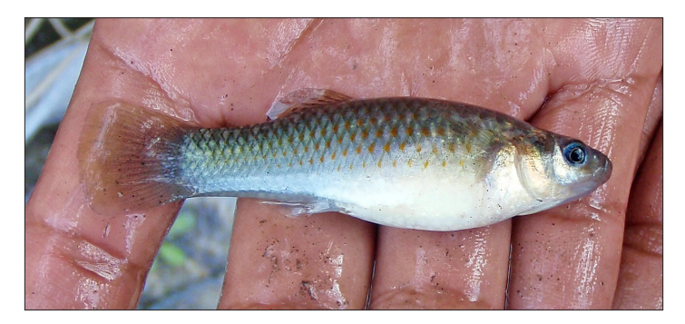
Figure 3. Our first natives (from top): Balsas Splitfin (female), Mexican Tetra, and Mexican Mollies (male and female).

young in geologic time. So, there haven't been long periods for major species radiations to occur in many areas. There are a few areas that are quite ancient, and they have higher diversity, whereas others are fairly new in geological time and thus have fewer species.