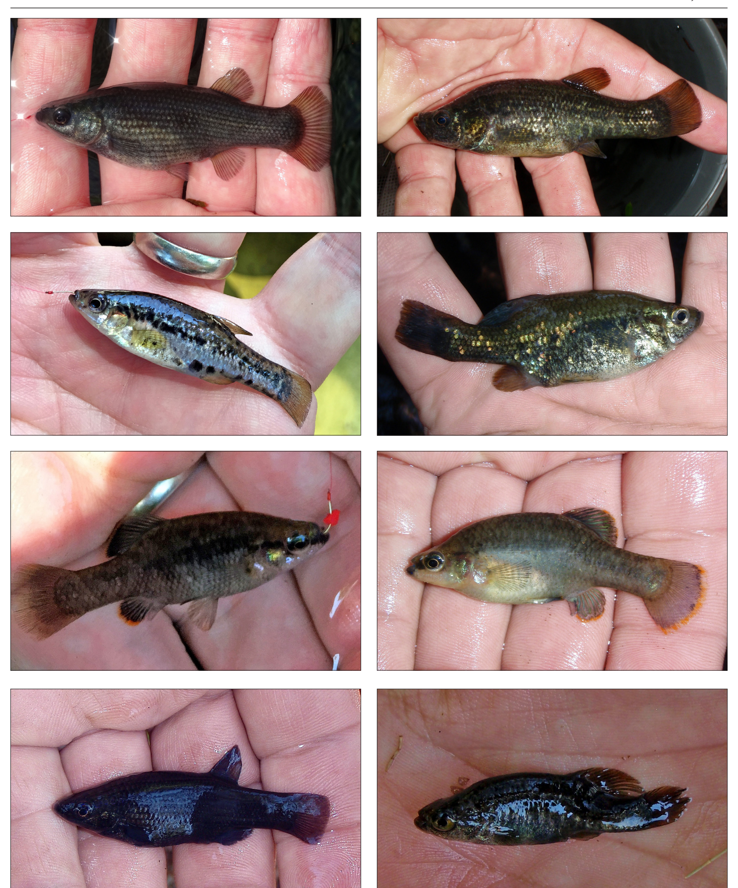
Figure 11. Left column, from top: Blackfin Goodea, Jeweled Splitfin, Picote Splitfin, and a very dark Blackfin Goodea. Right column, from top: Bulldog Goodeid, Jeweled Splitfin, Picote Splitfin, and Zacapu Splitfin.