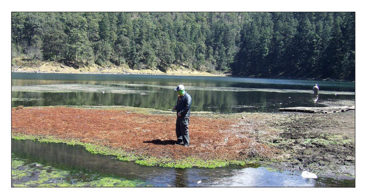
Figure 6. Top: Laguna Zempoala. Middle: Arroyo Trancas. Bottom: Ryan micro-fishing.

On the road again and long past lunch, we pulled into a roadside diner at the nearest town (Figure 8). I have to say the indigenous Mexican cuisine beats Taco Bell hands down! The cooks