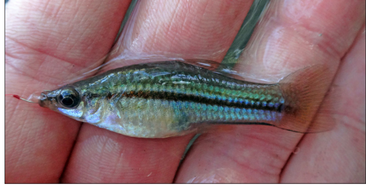
Figure 4. Our first exotics (from top): Blue Tilapia, Convict Cichlid, Spottail Killifish (female), and Green Swordtail (female).