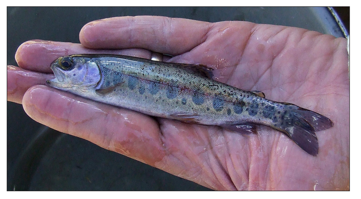
Figure 7. Top: Darkedged Splitfin. Bottom: Rainbow Trout.