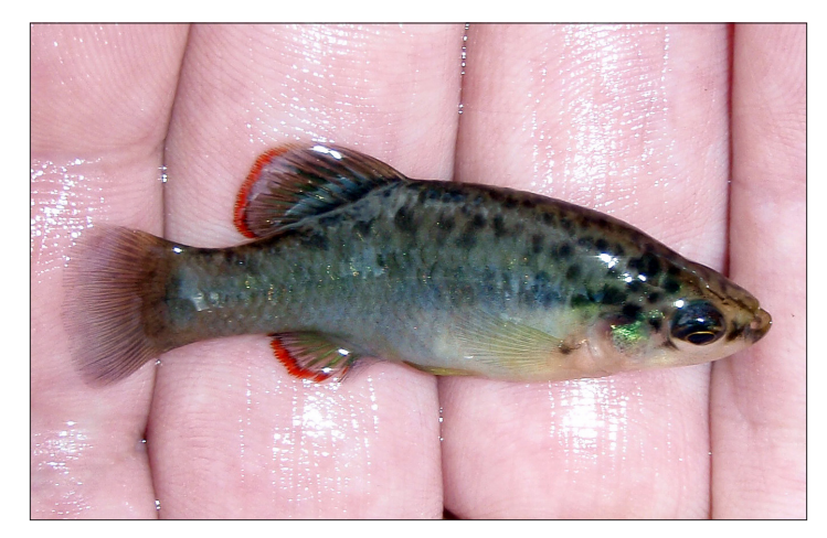
Figure 13. Left column, from top: Barred Splitfin, Splotched Skiffia (female), and Blackfin Goodea. Right column, from top: Lerma Livebearer (male), Splotched Skiffia (male), and Tarascan Splitfin.