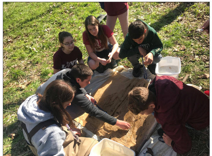
Figures 4–5. Vinton County Middle School Students exploring Puncheon Fork, a tributary to Raccoon Creek that runs behind the middle school.