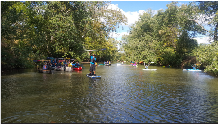
Figure 1. Participants in September 30, 2017, Raccoon Creek Public Float as they reach the confluence with the Ohio River.