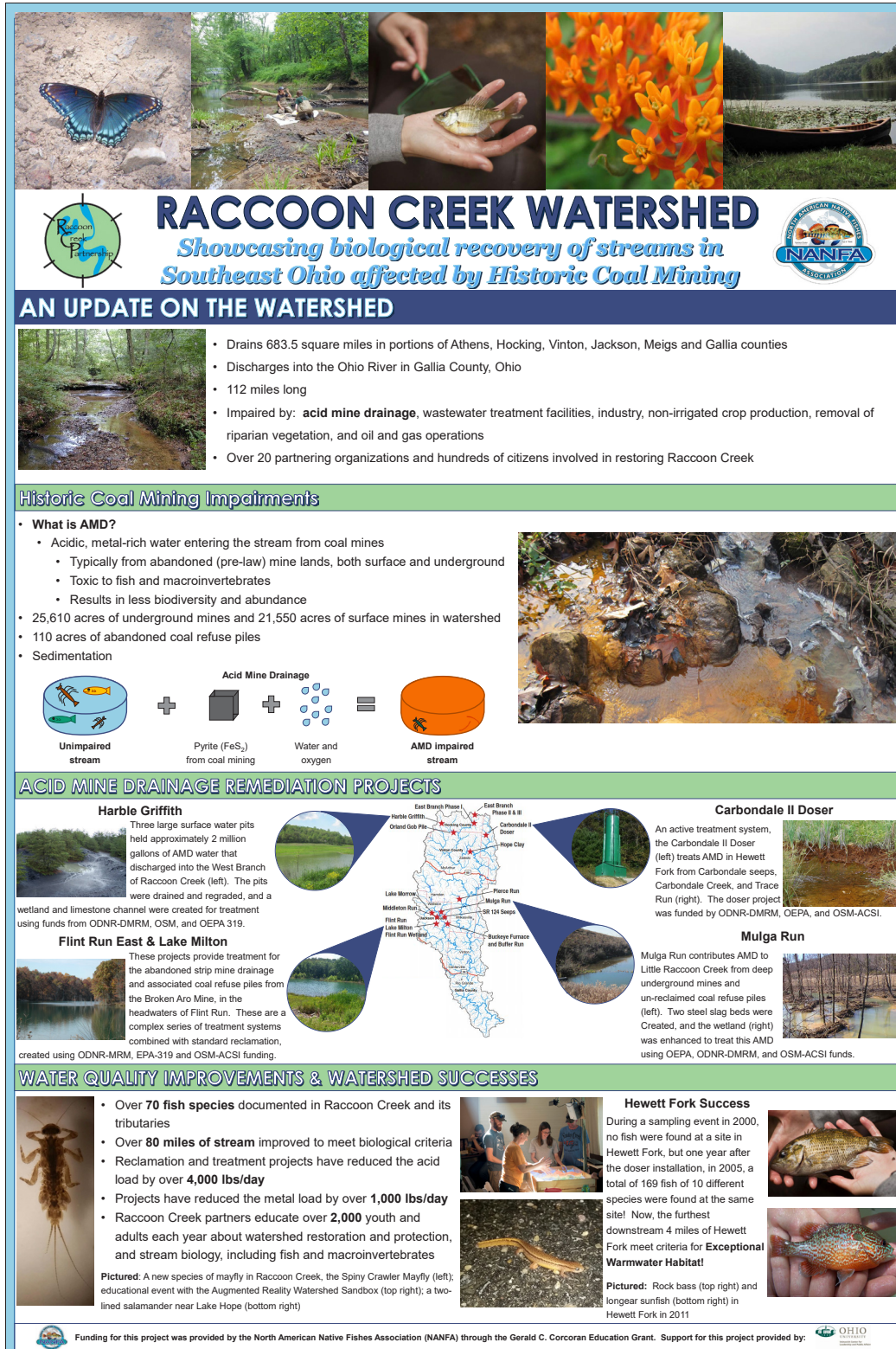
Figure 9. Raccoon Creek restoration poster designed by an Ohio University Environmental Studies student.

watershed restoration and recovery efforts that our partners (Ohio Department of Natural Resources – Division of Mineral Resources Management, Ohio Environmental Protection Agency, Office of Surface Mining, Ohio University, and many more) have made possible over the past 20 years.