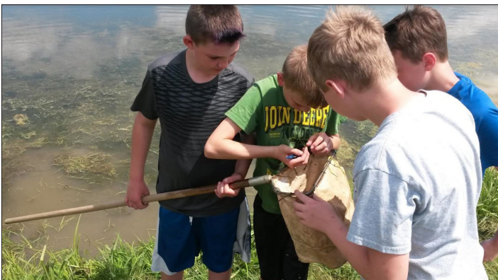
Figures 2–3. Students at Green Elementary School in Gallia County, Ohio, exploring the school pond.

vasive Bighead Carp ( Hypophthalmichthys nobilis ) and state-threatened Paddlefish ( Polyodon spathula ) recently documented (2016) in the Raccoon Creek Watershed. Gerald C. Corcoran Grant funds were used for event signage (Figure 1).