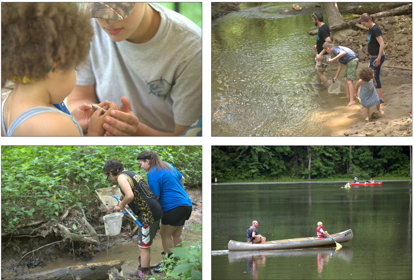
Figure 6. Aquatic explorations at 2018 Family Outdoor Day.

Grant funds were used to purchase dip nets, small aquariums, battery-powered air pumps and lights, and other supplies for collecting and presenting aquatic inhabitants (Figures 2–5).