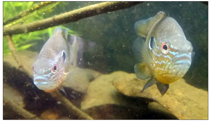
Figure 7. Yellow Bullhead (left) and Longear Sunfish in 75 Gallon Native Fish Aquarium at the Waterloo Aquatic Education Center.

invertebrate displays that utilize preserved macroinvertebrates to illustrate how different habitats are inhabited by different taxa, as well as providing a visual of tolerant, moderately tolerant, and sensitive taxa. These displays are available for use by watershed groups and agencies in the area and were used during classroom presentations at local schools (Figure 8).