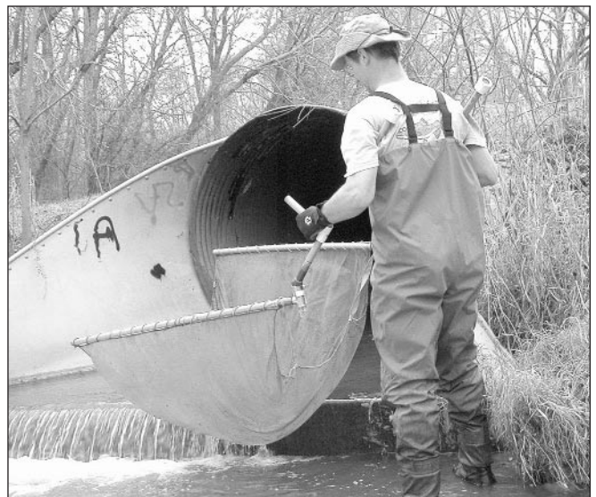
Counterclockwise from top left: Fig. 1. Handles unscrew for easy transportation. Fig. 2. Handles are positioned for running the seine or setting for a downstream kick. Fig. 3. The net can stand alone as a tripod. If the current is too strong, use the cord to hold the net in place. Fig. 4. Swivel handles to increase net's reach. Fig. 5. Left joint, front and back view.

(The right joint is a mirror image without the bottom coupling.) Nipples are forced into PVC pipe. Brail is screwed in by hand. 45°-elbow easily moves a half turn before hitting the stop.