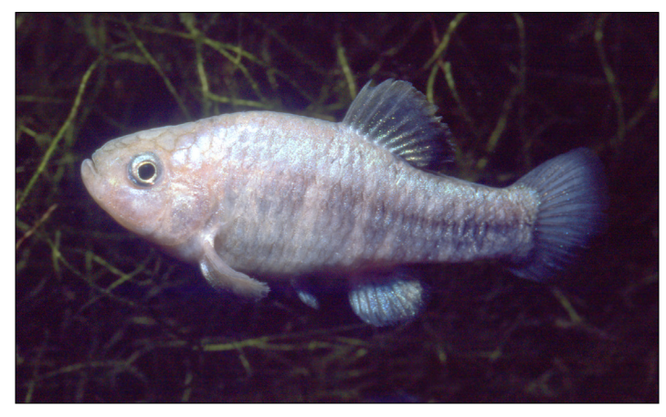
Figure 10. Male Owens Pupfish.