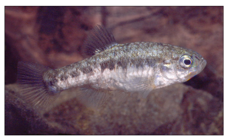
Figure 9. Female Owens Pupfish.

Rank-and-file American citizens have been generally apathetic about the conservation of biological diversity, but one would hope not to find similar unconcern within the scientific community. Yet there is much complacency among professionals, particularly among those biologists