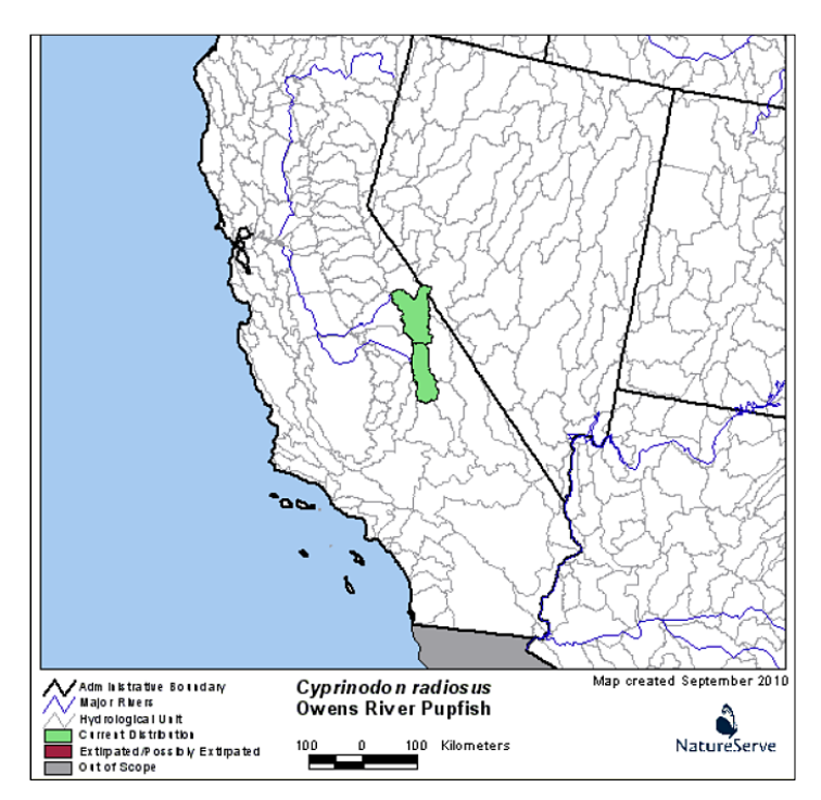
Figure 3. Owens Pupfish Range Map.

Today I sit at my desk surrounded by forty little pocket diaries, each one summarizing a year of my career. So many memories and experiences are packed into these 2.5- by 4-inch volumes, which, together, fill less than a shoe box. Daily entries recall a multitude of experiences: scaling through the usual routine meetings, conduct-