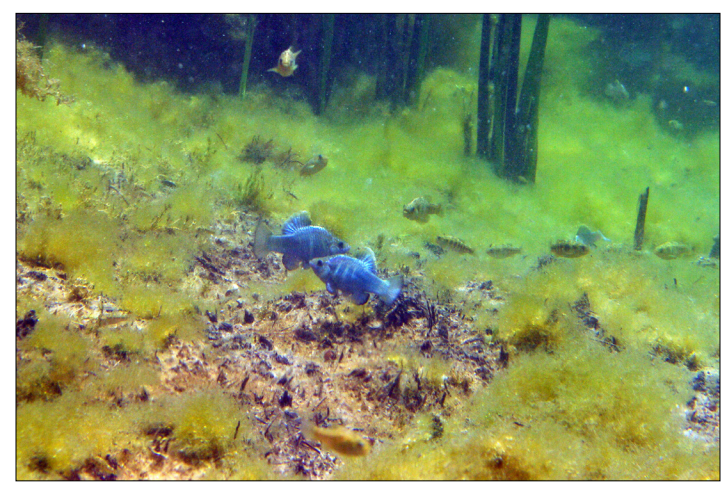
Figures 7 and 8. Male Owens Pupfish displaying to females in Fish Slough Area of Critical Environmental Concern (Inyo County, California).