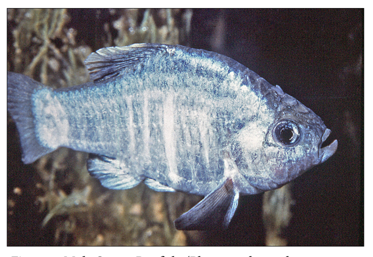
Figure 1. Male Owens Pupfish.

Virtually my entire career was spent as a district fishery biologist for the California Department of Fish and Game in the state's vast eastern sierra and desert regions. I worked on a great variety of management and research programs--from trying to keep millions of sports fishermen supplied with trout to preserving the biological