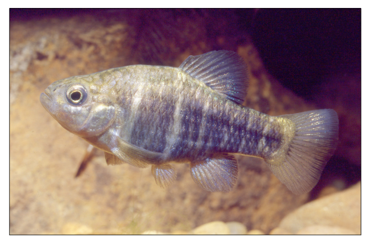
Figure 11. Different color phase of Male Owens Pupfish.