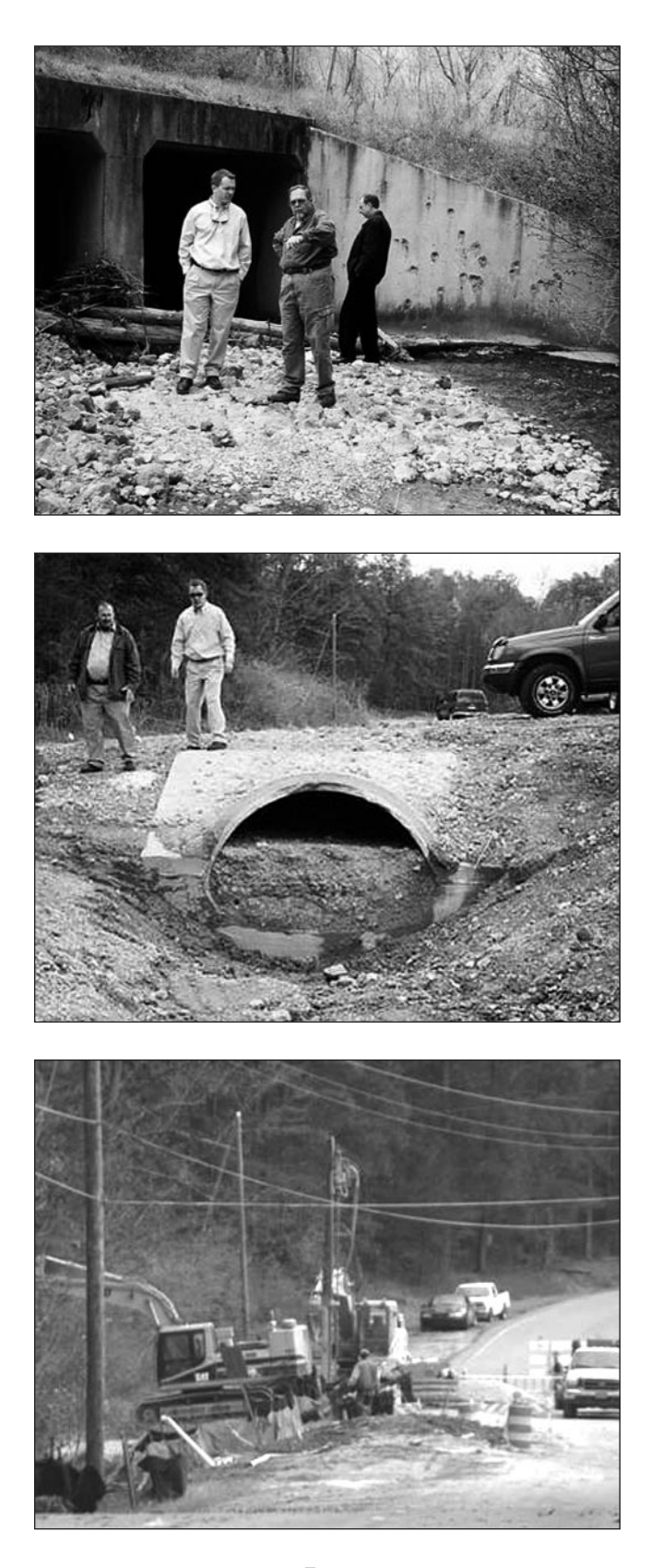
Fig. 2. Turkey Creek, Jefferson County, Alabama, in 2004.

for a population that only occurs in one stream. However, this estimate may not be unrealistic because high density of populations of darters in a small stream have been observed (Powers, 2003). A 2005 survey of E. chermocki found 13 individuals in a spring-fed stream and 15 individuals within approximately 50 m in an unnamed tributary of Beaver Creek, the latter representing an atypical habitat for E. chermocki in that it has a silty bottom and slow current (pers. obs.). It is possible that Turkey Creek may have been able to sustain as many as 10,000 individuals of E. chermocki . If this hypothesis was true, then the reduction of the population size would match the estimated effective population size, indicating substantial decline of the E. chermocki population.